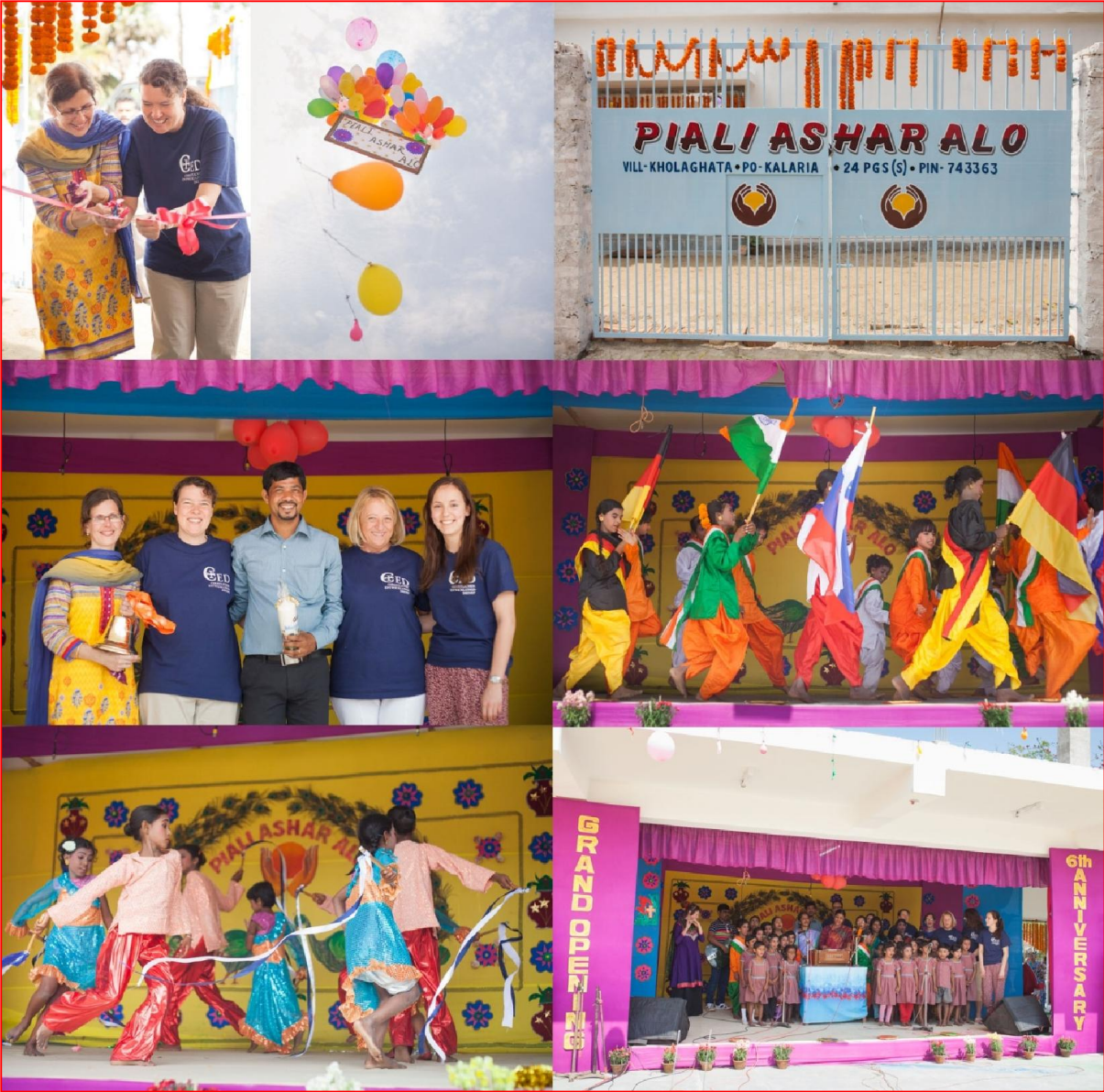
A few photographs from our special day: